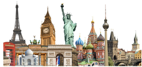
Figure 3: Image containing several landmarks (Scenario 2).

backend server using NodeJS to receive the coordinates from our App and broadcast this data to the user’s browser.