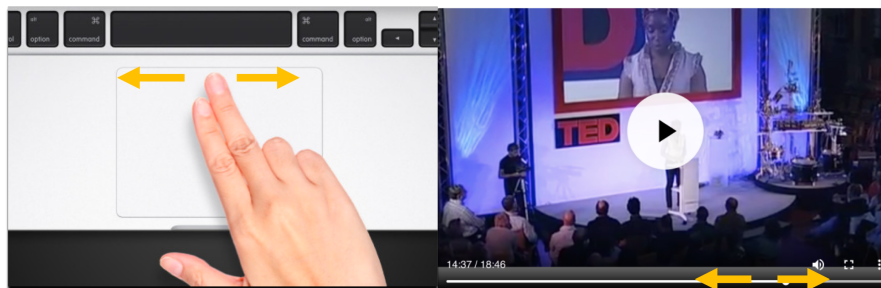
Figure 1: Using the touchpad to control a video slider (Context 1).